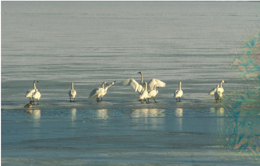
Tundra Swans.

In this plan, we encourage our partners to take advantage of both IBA program services, as well as site-specific conservation planning undertaken by the U.S. Fish and Wildlife Service (for Nevada's National Wildlife Refuges), Nevada Department of Wildlife (for Nevada Wildlife Management Areas and gamebird management), the National Park Service (National Parks and Recreation Areas), and by other agencies and organizations. These site-specific conservation efforts are extraordinarily useful for birds that cluster into particular sites or habitats, such as most waterbirds, shorebirds, and waterfowl; riparian species, and mesquite-acacia associated birds.