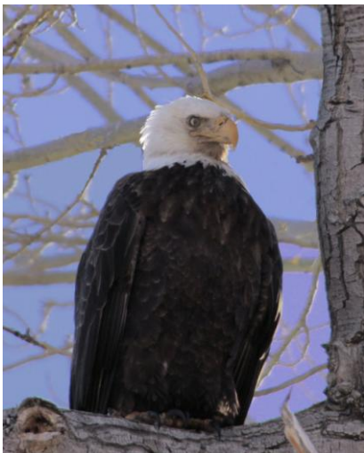
Bald Eagle.

A total of 482 species of birds have been recorded in Nevada (Nevada Bird Records Committee, pers. comm.), and of these, 300 species have either nested or are estimated to occur with some regularity in the state (Appendix 1). Of the 300 species, 252 are