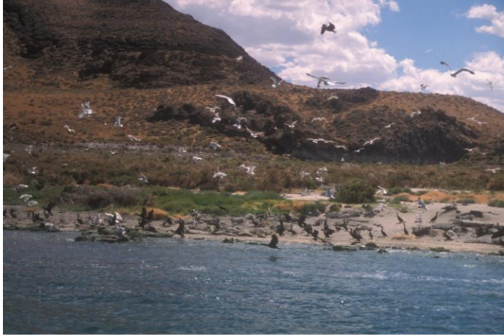
Waterbirds on Pyramid Lake, with Anaho Island in the background.